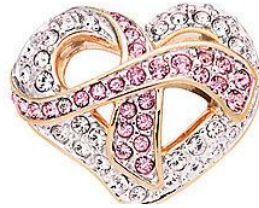
Swarovski's Pink Hope Pin

Swarovski's Pink Hope Pin retails for $85 and is available at Swarovski Gallery stores nationwide and at www.swarovski.com . For local stores, consumers can call 1-800-426-3088.